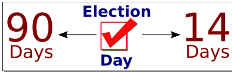
Figure 3 – Sign Display Time-Frame