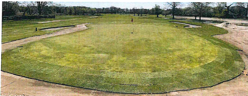
Image from behind the 6 th green, captured April 20