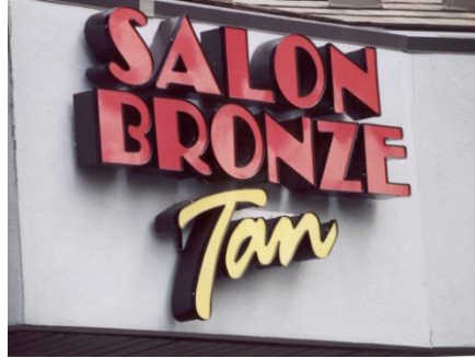
Example of Channel Lettering

CHANNELIZATION. Any improvements or other construction activity which occurs within or in the vicinity of an existing natural drainage-way or perennial stream which directs or relocates said waterway along some desired course, by increasing its depth or by the use of piping or any other manmade storm drainage structures.