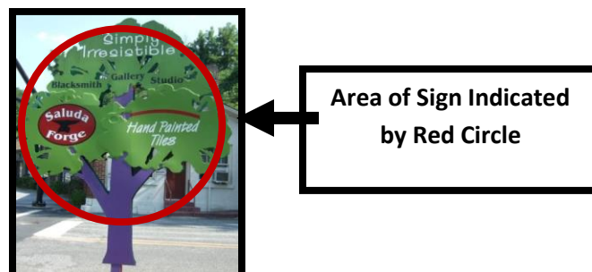
Example Illustrating Measurement of the Area of an Irregularly Shaped Sign

SIGN AREA. The size of a sign in square feet as computed by the area of not more than two standard geometric shapes (specifically, circles, squares, rectangles, or triangles) that encompass the shape of the sign exclusive of the supporting structure.