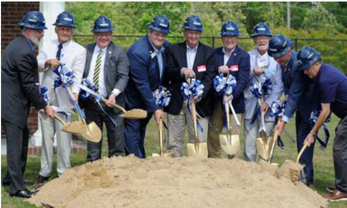
Airport and community officials and legislators ceremoniously break ground on April 26.

Local and state officials and community members broke ground on a $20 million airport modernization program for Washington-Warren Airport on April 26. The airport will use funds provided by the N.C. General Assembly to complete a wide range of projects to transform the airport, originally built in the 1940s to train pilots.