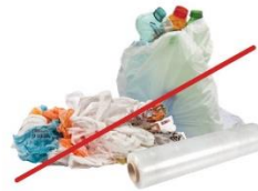
NO Loose Plastic Bags, Film or Recyclables in Bags