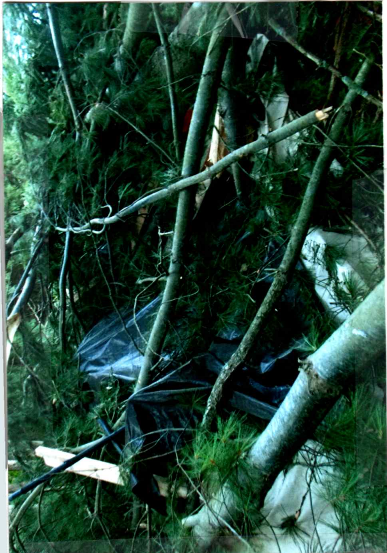
Damage from August 4, 2020 storm