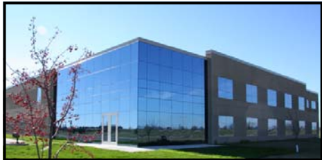
Samples of commercial and industrial uses.