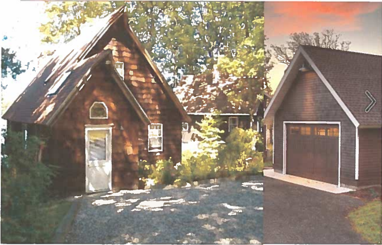
Conceptual View (garage siding, eaves and color will match house)