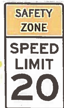
Fig. 9-3: MA-R2-8 Sign

Safety Zone speed limits are the only regulatory speed limits that municipalities can adopt on city- and town-owned ways without approval from MassDOT. Safety Zones cannot be placed on State Highway without prior written approval of MassDOT. Speed limits within a Safety Zone must be set at 20 mph and are intended to be used in areas where vulnerable road users are likely to be present, such as parks and playgrounds, senior citizen housing and centers, hospitals or other medical facilities, high schools and higher education centers, and daycare facilities. Please note that Safety Zones should not be used in place of School Zones for streets adjacent to grades 1-8 schools.