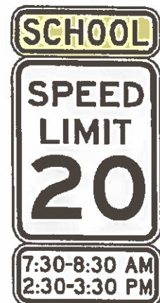
Fig. 9-4: R2-1 Sign with S4-3P and S4-1P Plaques

Cities and towns are responsible for modifying their Municipal Traffic Code to reflect the locations and days and times of operation for all School Zones prior to the posting any signage. The sign assembly that is used to identify the school zone speed limit for drivers should be similar to Fig. 9-4; the assembly may