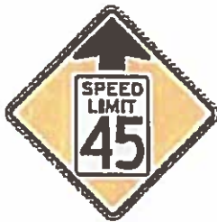
Fig. 9-2: W3-5 Sign

Reduced Speed Limit Ahead (MUTCD code W3-5) signs are warning signs that inform road users of an upcoming reduction in the regulatory speed limit. The MUTCD recommends their use any time the speed limit is being reduced by more than 10 mph. When used properly it can be an effective tool to reduce the likelihood of sudden drops in free-flow speed.