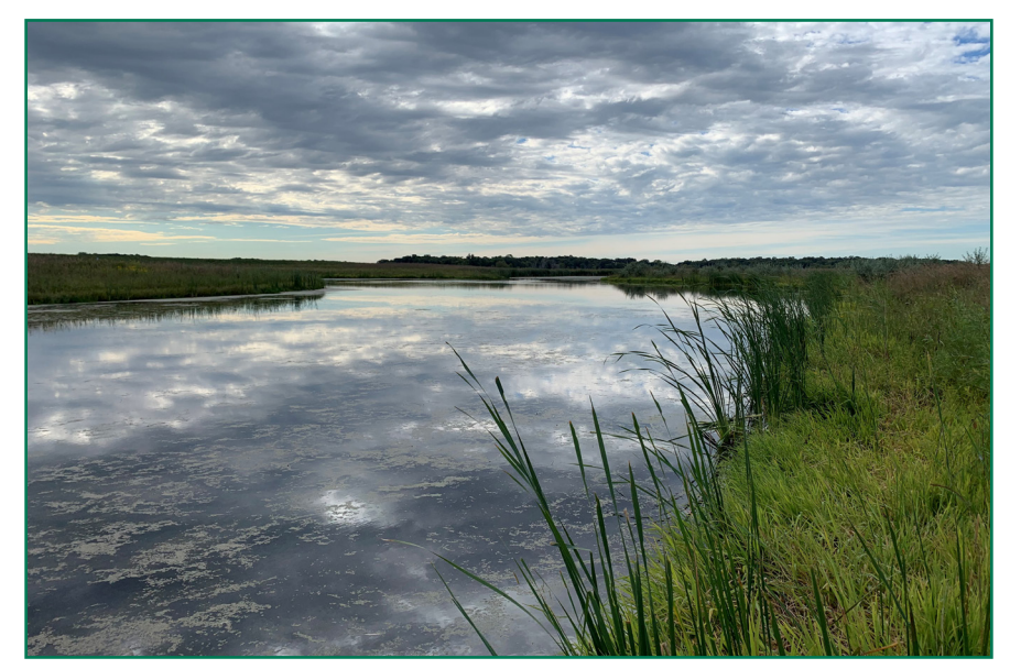
Clouds reflect on the partially restored north end of Grass Lake. Once the $5.5 million restoration is complete, Grass Lake will resemble a cattail marsh. Watershed modeling and previous data collection project the Grass Lake restoration will reduce sediment-loading from a 13-square-mile drainage area to downstream waters by more than 90%. It's expected to reduce phosphorus by nearly 60%.

Twenty-five conservation easements — 22 of them perpetual RIM easements, two of them 30-year easements through NRCS' Federal Wetlands Reserve Program, one a Kandiyohi County perpetual easement — protect the entire 1,500-acre project area, which encompasses seasonal wetlands and upland habitat.