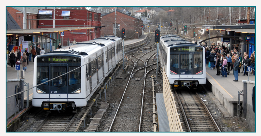
Trains near Heather's apartment in Oslo, Norway.