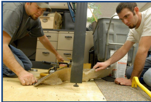
We gently pry up the partitions to facilitate old carpet removal.

Furniture lifting is a revolutionary system to enable the installation of flooring without removing furniture from your commercial space or you having to close your business. We use specialized equipment to replace your flooring quickly after hours without you having to lift a finger, let alone your desk.