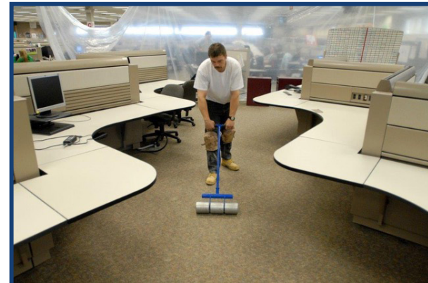
Roll the new carpet to ensure adhesion, and we are done!

We are proud members and supporters of the Association of Minnesota Counties, State Engineers Guild, Minnesota Park and Recreation Association, Minnesota Library Association, Aging Services, Minnesota Association of School Maintenance Supervisors, Minnesota Association of School Administrators, Minnesota Association of School Business Officials, and Minnesota School Boards Association.