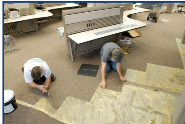
The field carpet is installed.