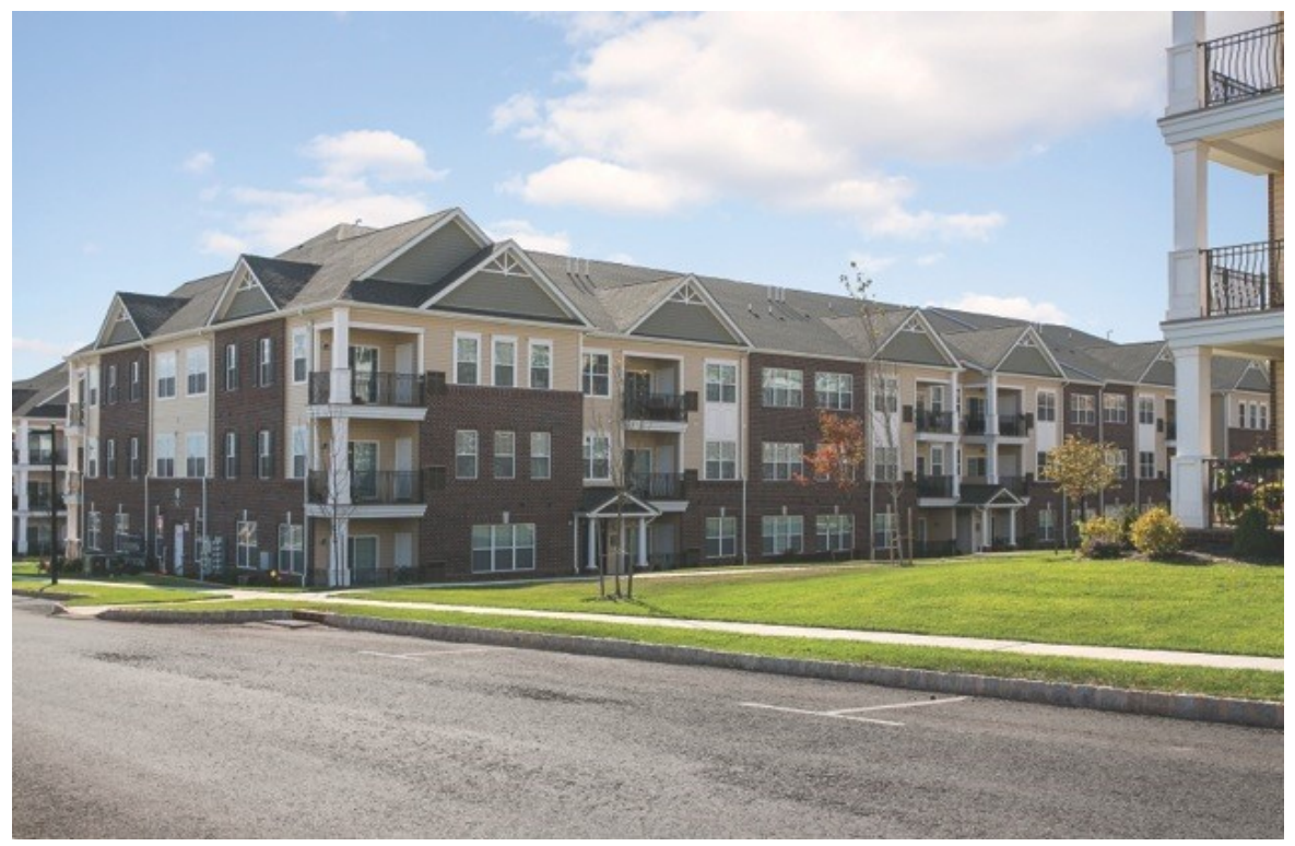
Stone Bridge at Raritan features one-, two- and three-bedroom moderate income homes reserved for the large concentration of Military veterans that reside in and around this Somerset County, N.J. Borough.