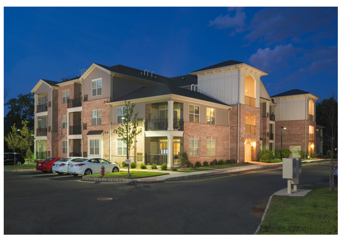
Sunnymeade Run boasts 122 one-, two- and three-bedroom affordable rental homes in Hillsborough Township.