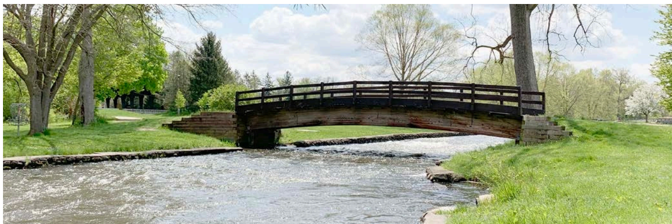
Bridge across the Kalamazoo River.