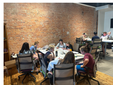
YACers making round two decisions in the late May meeting at The Office Albion.

YAC is currently planning for an information and recruitment booth at the French Market on June 21st.