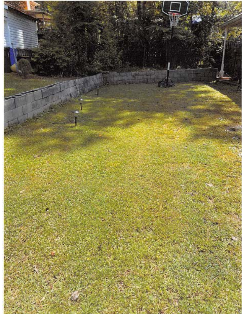
Location to be Paved for Driveway