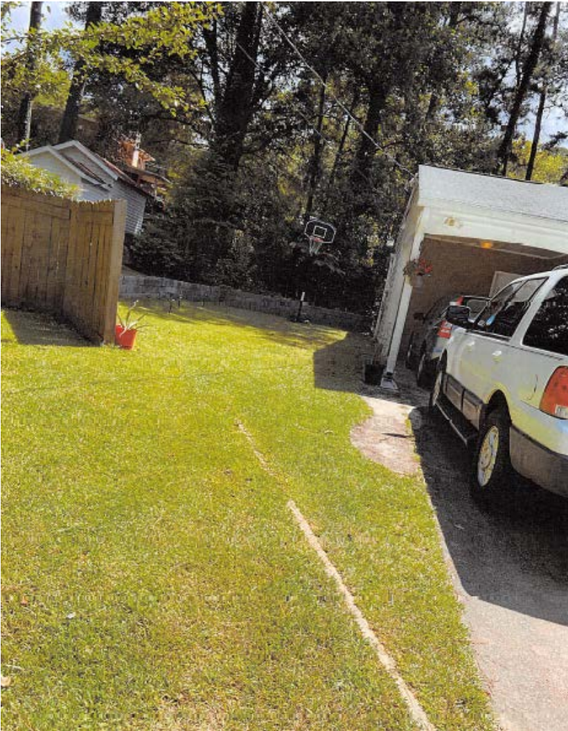
Location to be Paved for Driveway