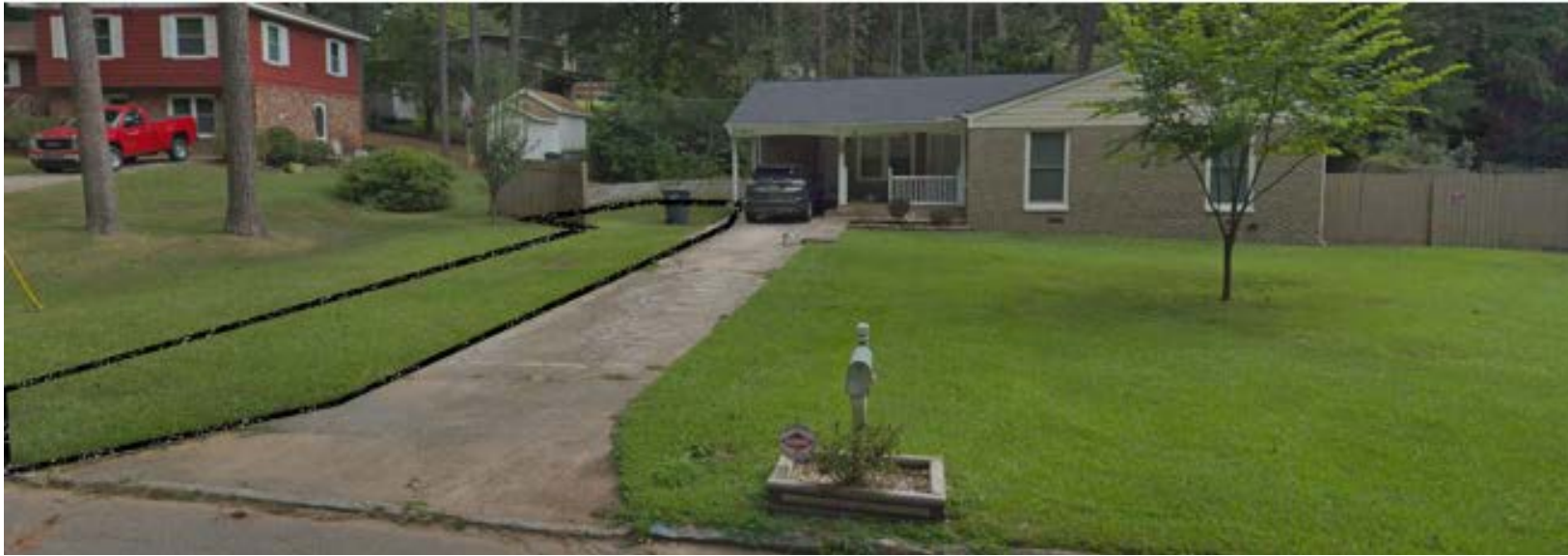
Front of House and Proposed Driveway Addition