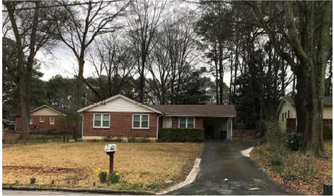
Front of House Showing Existing Front Patio