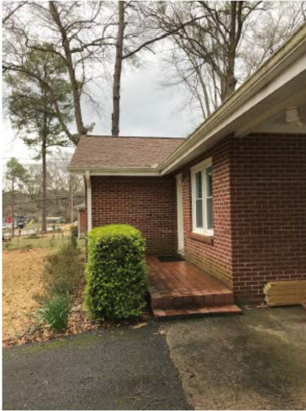
Porch to be Enclosed and Expanded