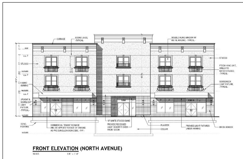
Mixed use development project currently under construction at 150 North Avenue

The property at 150 North Avenue is located on the corner of North Avenue and Jackson Avenue. The property was previously an empty parking lot. Construction is underway for a three-story mixed-use building consisting of 1,578 square feet of first floor commercial/retail space with 14 rental apartments above with two affordable housing units. There will be ground-level covered parking for use by residents and businesses.