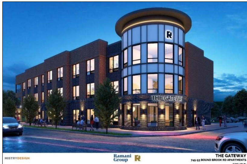
Proposed development project "The Gateway" at 745-753 Bound Brook Road

Update on the Firehouse: The Dunellen Firehouse suffered damage in October 2021 and has not been occupied since. The Borough's architects, Alloy5, prepared plans and specifications for the rebuild and the project was bid in January of this year. After reviewing the submissions, and upon the recommendation of Alloy5, the Dunellen Borough Council awarded a contract to H&S Construction and Mechanical of Elizabeth, New Jersey on March 20. H&S is now submitting the required insurance documents and we are preparing for the actual construction, which will be overseen by a Construction Manager to be hired soon by the Borough.