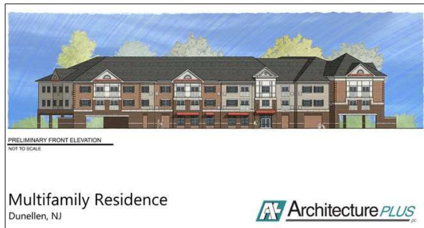
Residential development project currently under construction at 528 North Avenue

There are two redevelopment projects under construction on North Avenue, one at 528 North Avenue and the other at 150 North Avenue. The 528 North Avenue property is located at the fork where North Avenue becomes Bound Brook Road and is next door to Blacher Canvas. The previous buildings on the site were damaged in a fire several years ago. Construction is underway for a 43,200 square foot apartment complex which will have 40 rental apartments with six affordable housing units.