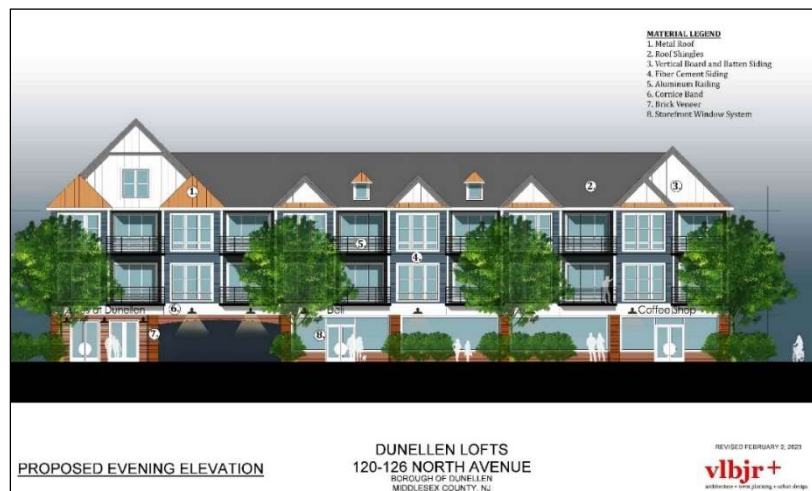
Proposed development project "Dunellen Lofts" at 120-126 North Avenue