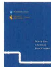
Category R Sewer Root Control