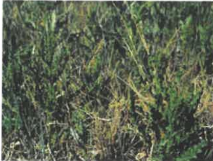
Figure 3: Canada thistle bolting growth stage in spring.

Canada thistle allocates most of its reproductive energy into vegetative propagation. New shoots and roots can form almost anywhere along the root system of established plants (Figure 6). Tillage segments roots and stimulates new plants to develop. Shoots emerge from root and shoot pieces about 15 days after disturbance by tillage. Small root pieces, 0.25 inch long by 0.125 inch in diameter, have enough stored energy to develop new plants. Also, these small roots can survive at least 100 days without nutrient replenishment from photosynthesis.