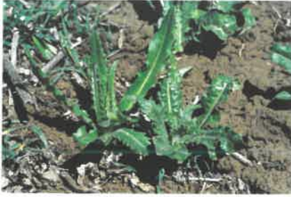
Figure 2: Emerged Canada thistle rosettes from roots in early spring.