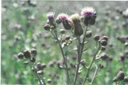
Figure 5: Canada thistle in flowering growth stage.