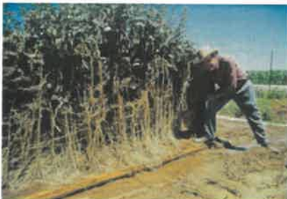
Figure 6: Canada thistle root system after 14 months growth from 25 vegetative shoot cuttings.

inches tall. Repeat mowings at about one month inter-vals. Apply Curtail at 2 to 3 quarts/A in October or about one month after the third mowing. Follow this regimen for two consecutive years.