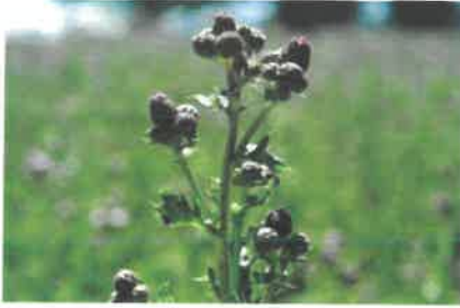
Figure 4: Canada thistle in the late bud growth stage.