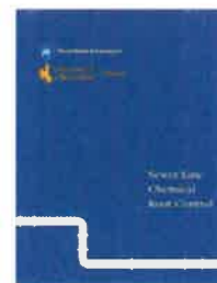
Category R Sewer Root Control