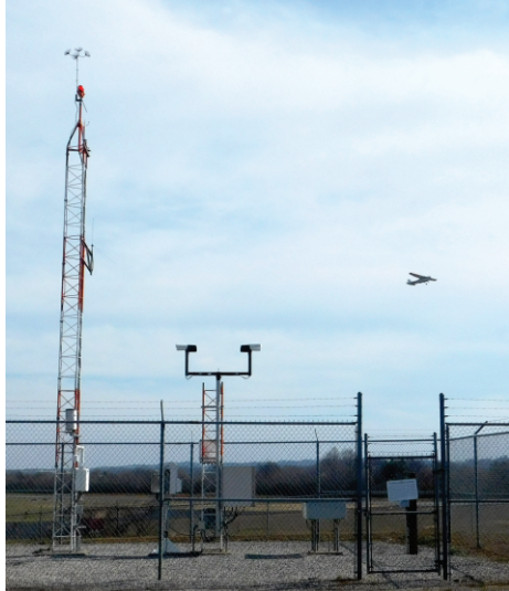
Morristown Airport's Weather Station

The Morristown Regional Airport is one of 40 airports in the state that utilizes a state-of-the-art technology called "AWOS" (Automated Weather Observing System).