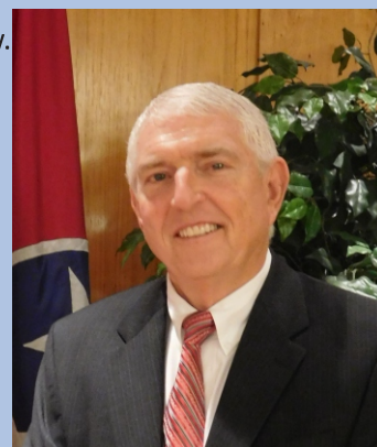
Mayor Gary Chesney