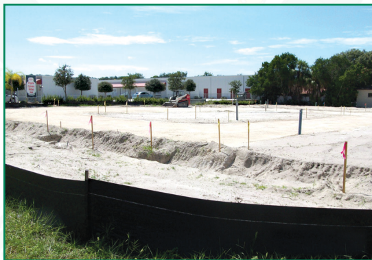
Silt Fence At Construction Site