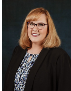
Everly Chadwick Communications 928-759-3123