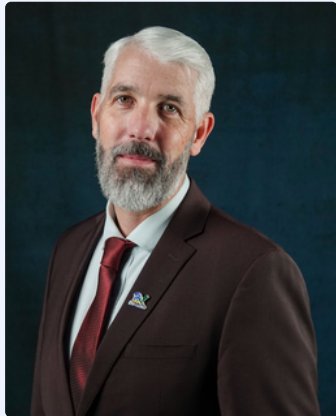
Mayor Kell Palguta