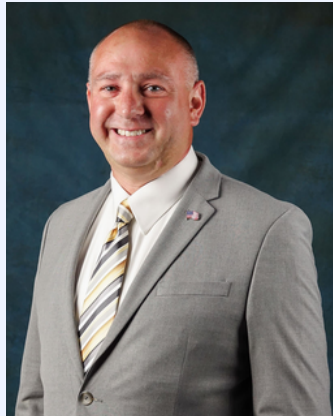
Vice Mayor Matt Zurcher