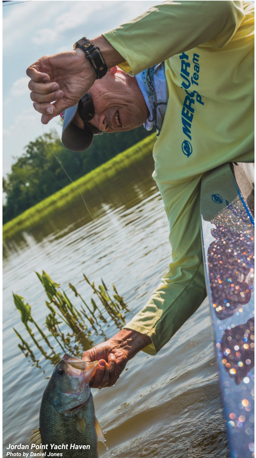
Jordan Point Yacht Haven

Jordan Point Yacht Haven has partnered with the Chesapeake Bay Foundation (CBF) for over 30 years! CBF works to restore and protect the Chesapeake Bay, and this partnership gives students the opportunity to explore wetlands.