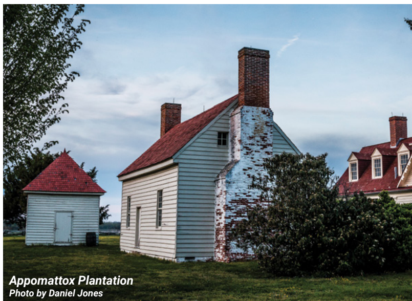
Appomattox Plantation