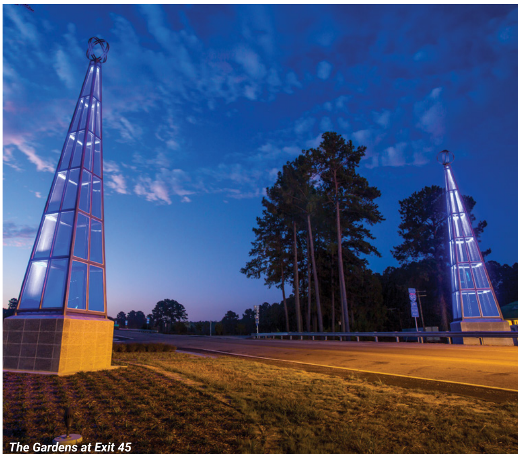
The Gardens at Exit 45