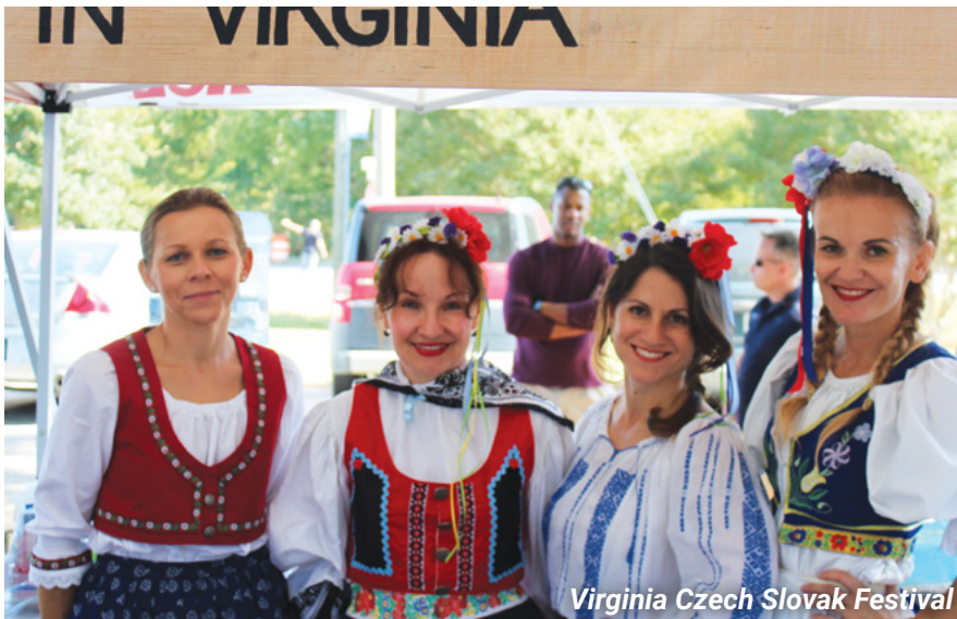
Virginia Czech Slovak Festival