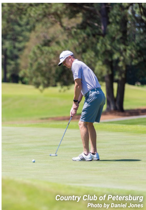
Country Club of Petersburg