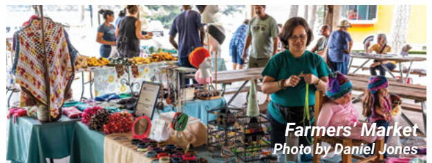
Farmers' Market