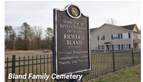
Bland Family Cemetery