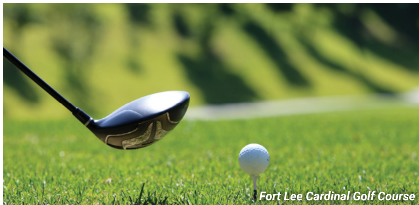
Fort Lee Cardinal Golf Course