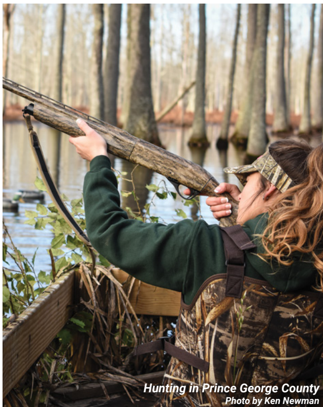
Hunting in Prince George County