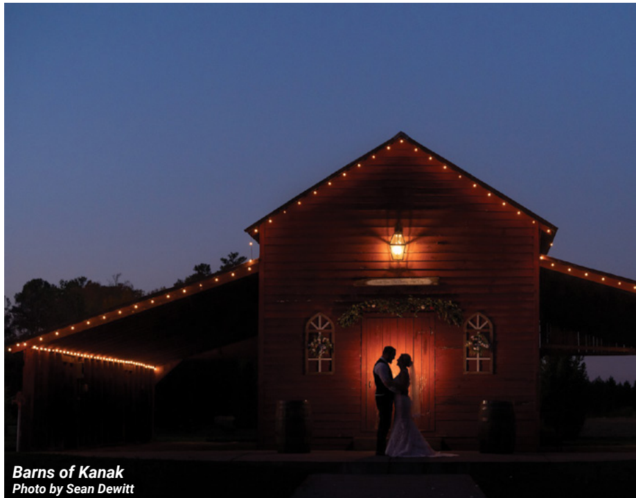
Barns of Kanak