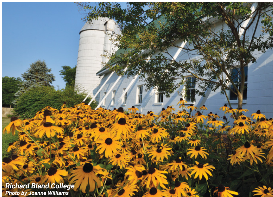
Richard Bland College