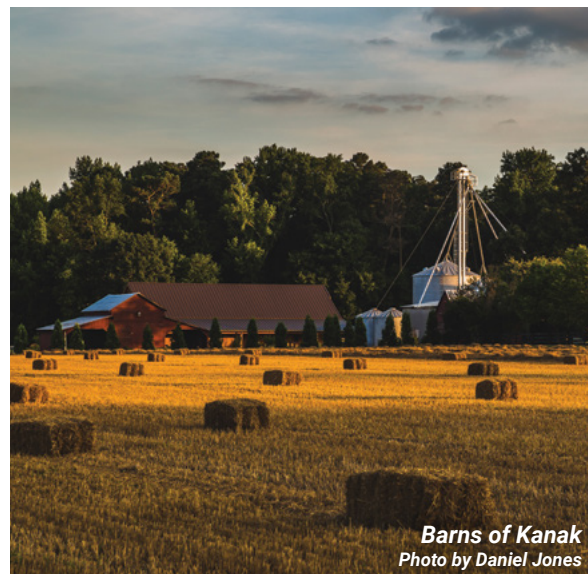
Barns of Kanak