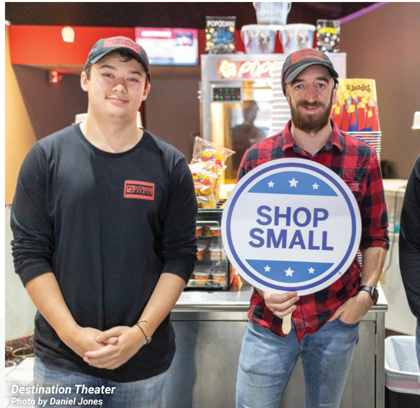
Destination Theater