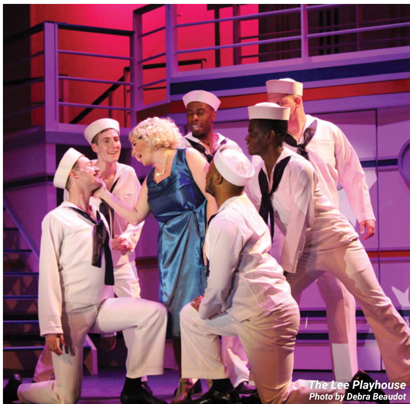
The Lee Playhouse

The Cardinal Golf Course Quick Service Restaurant offers hot and cold sandwiches, beverages and a wide selection of draft and canned beer with three televisions to enjoy multiple broadcast events.