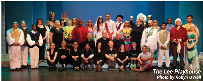
The Lee Playhouse