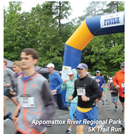
Appomattox River Regional Park 5K Trail Run