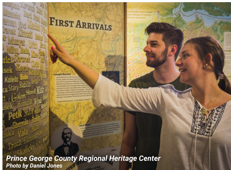
Prince George County Regional Heritage Center