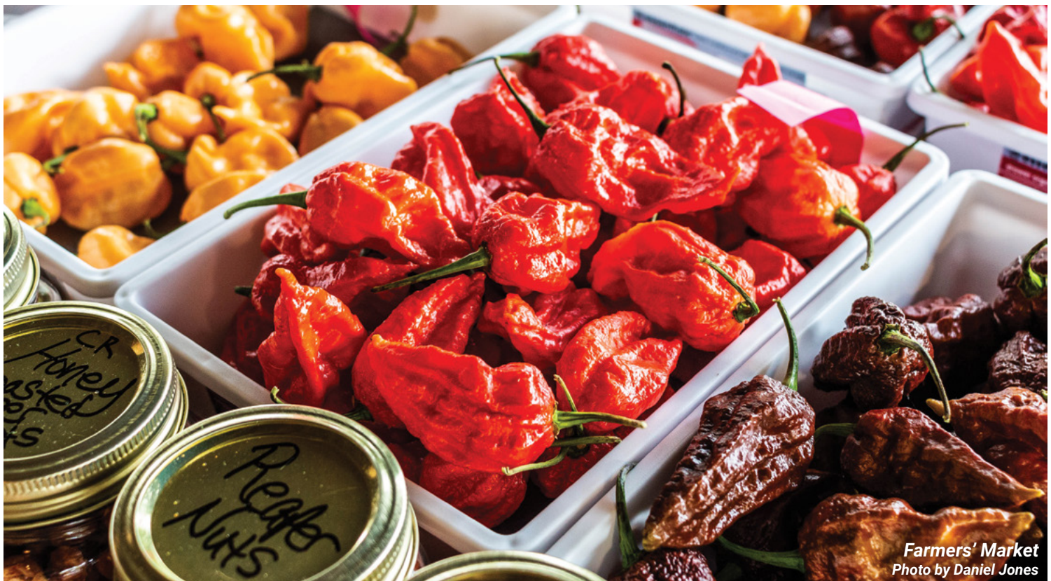
Farmers' Market