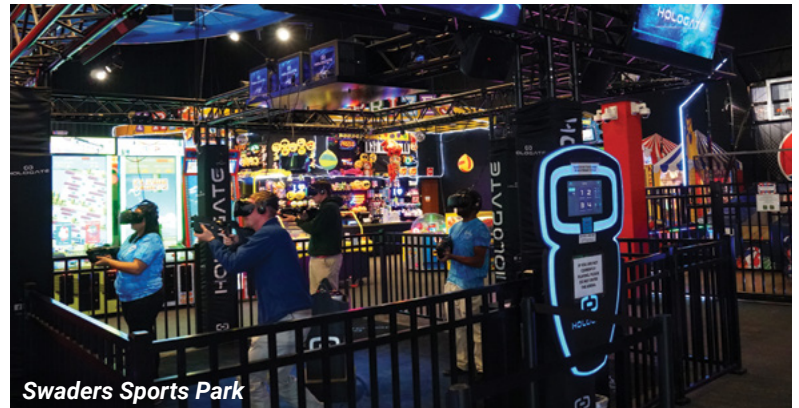
Swaders Sports Park