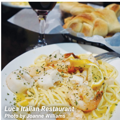
Luca Italian Restaurant