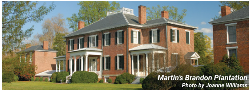
Martin's Brandon Plantation