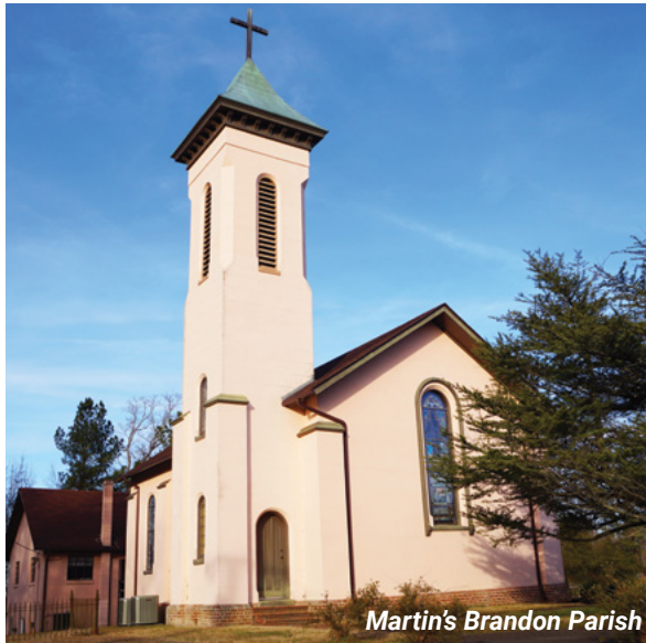
Martin's Brandon Parish