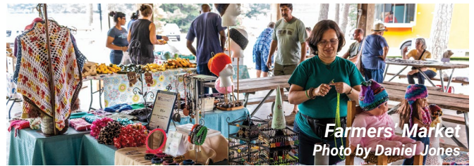
Farmers' Market