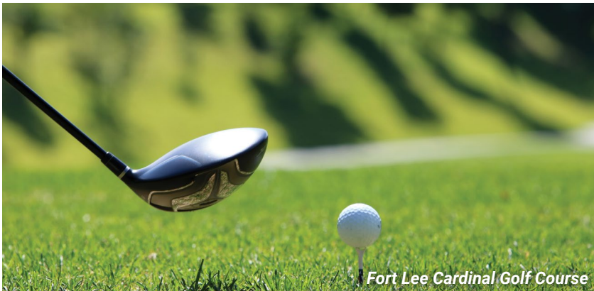
Fort Lee Cardinal Golf Course

The Cardinal Golf Course Quick Service Restaurant offers hot and cold sandwiches, beverages and a wide selection of draft and canned beer with three televisions to enjoy multiple broadcast events.