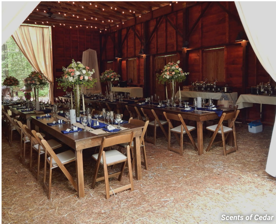
Scents of Cedar