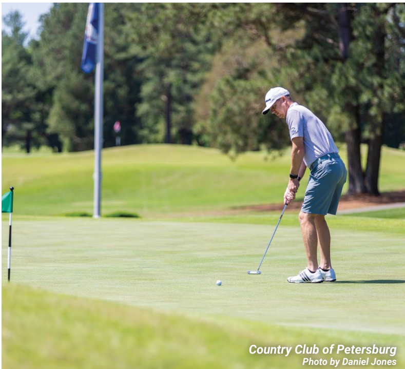
Country Club of Petersburg