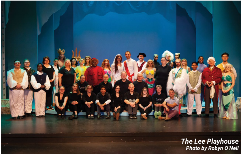
The Lee Playhouse