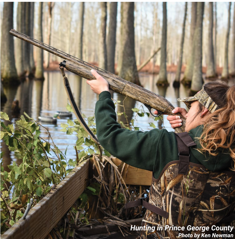
Hunting in Prince George County