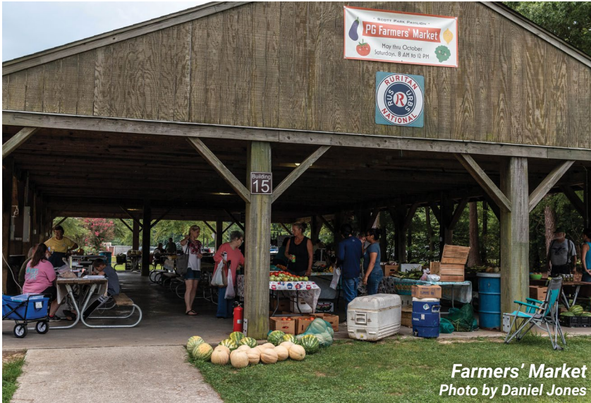
Farmers' Market

Prince George County is dedicated to building a sustainable, regional foodshed and educating people about the benefits of sustainable agriculture. Our producer-grower farmers' market emphasizes the direct connection between local food choices and the quality and health of our environment and daily lives. We support farmers/growers who cultivate the land using sustainable agricultural practices or raise livestock using humane and sustainable practices. By providing these farmers/growers with direct markets for their products, Prince George helps sustain the regional farm economy and helps ensure the future of farming in our area.