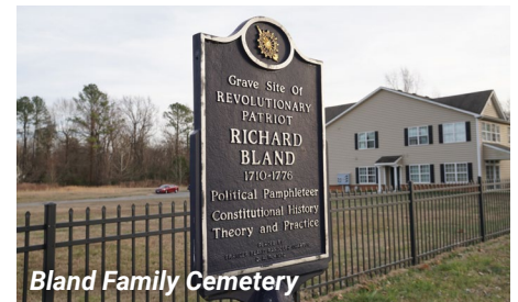
Bland Family Cemetery