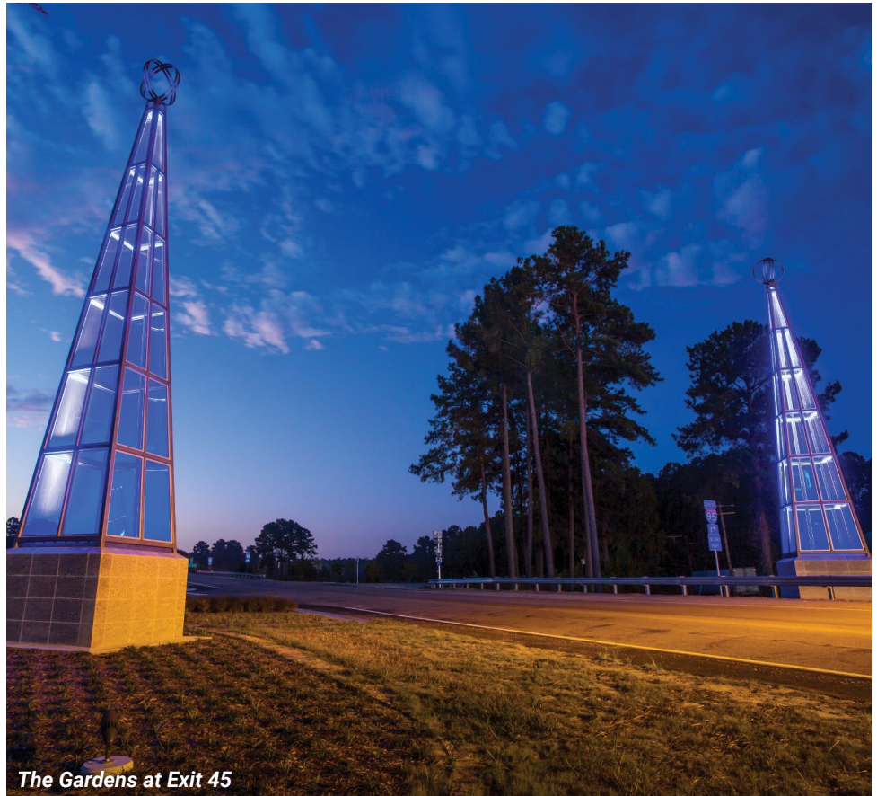
The Gardens at Exit 45