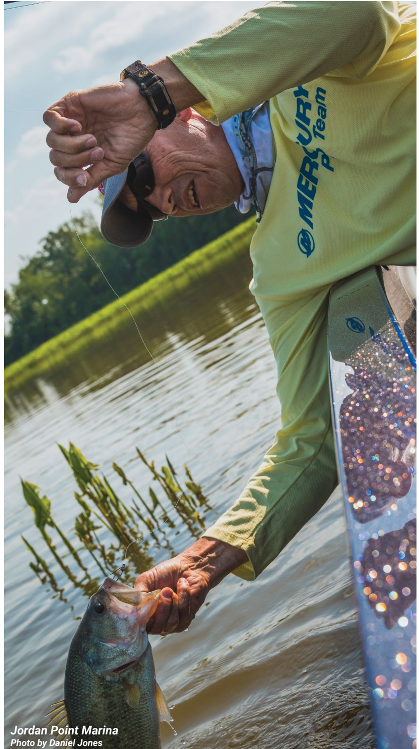
Jordan Point Marina

Jordan Point Marina has partnered with the Chesapeake Bay Foundation (CBF) for over 30 years! CBF works to restore and protect the Chesapeake Bay, and this partnership gives students the opportunity to explore wetlands.