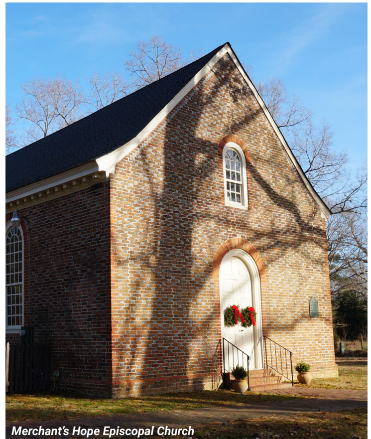
Merchant's Hope Episcopal Church