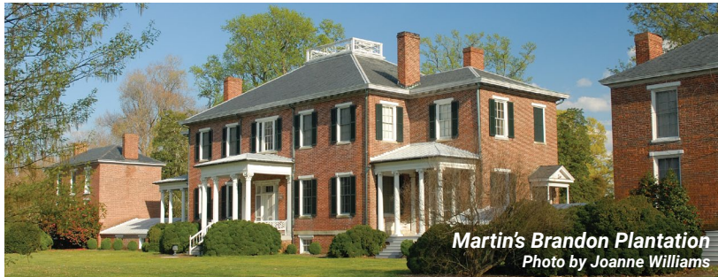
Martin's Brandon Plantation