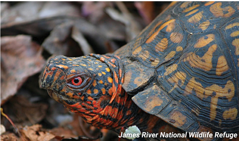
James River National Wildlife Refuge