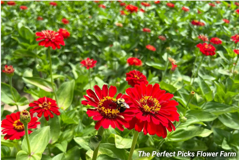
The Perfect Picks Flower Farm