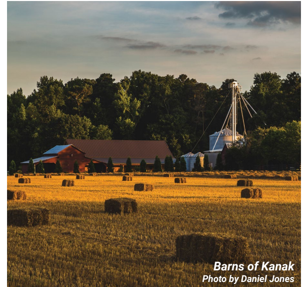
Barns of Kanak