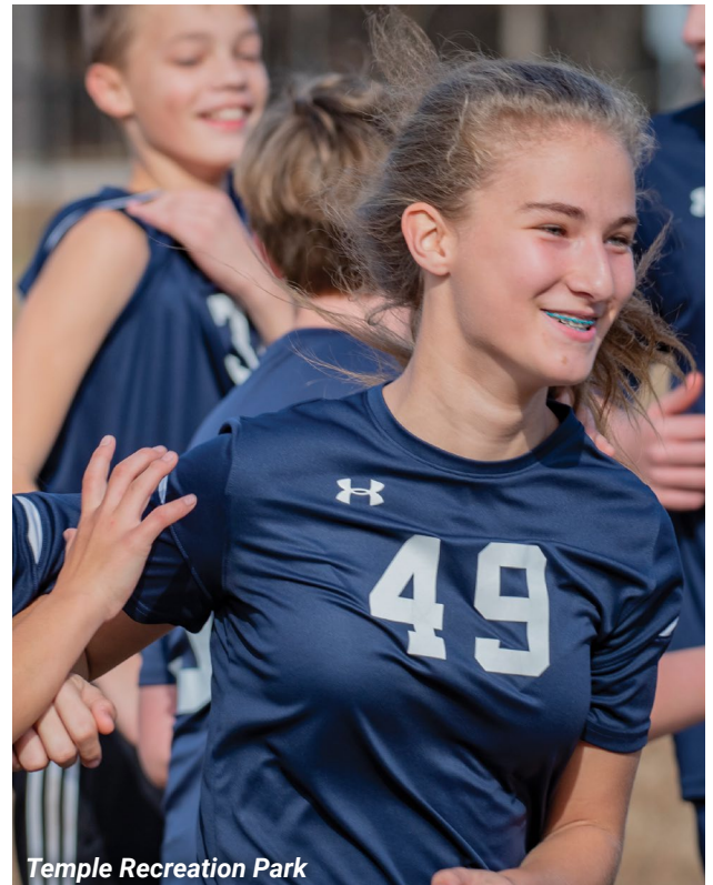
Temple Recreation Park

With 52 acres, JEJ Moore Athletic Complex features four multi-purpose baseball/softball fields, a soccer field, a concession area, restrooms, a playground, and walking trails.