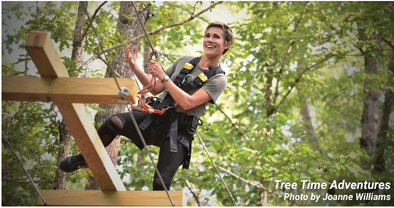
Tree Time Adventures