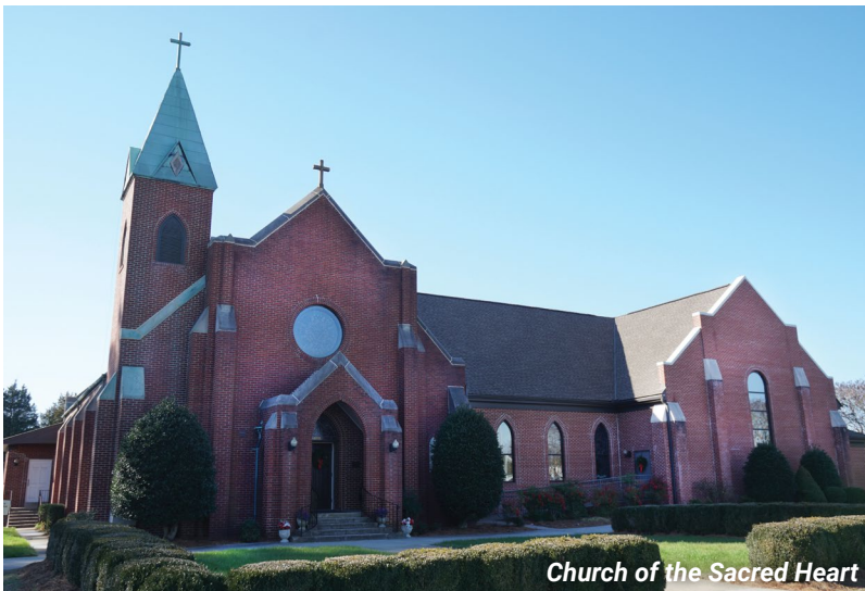
Church of the Sacred Heart