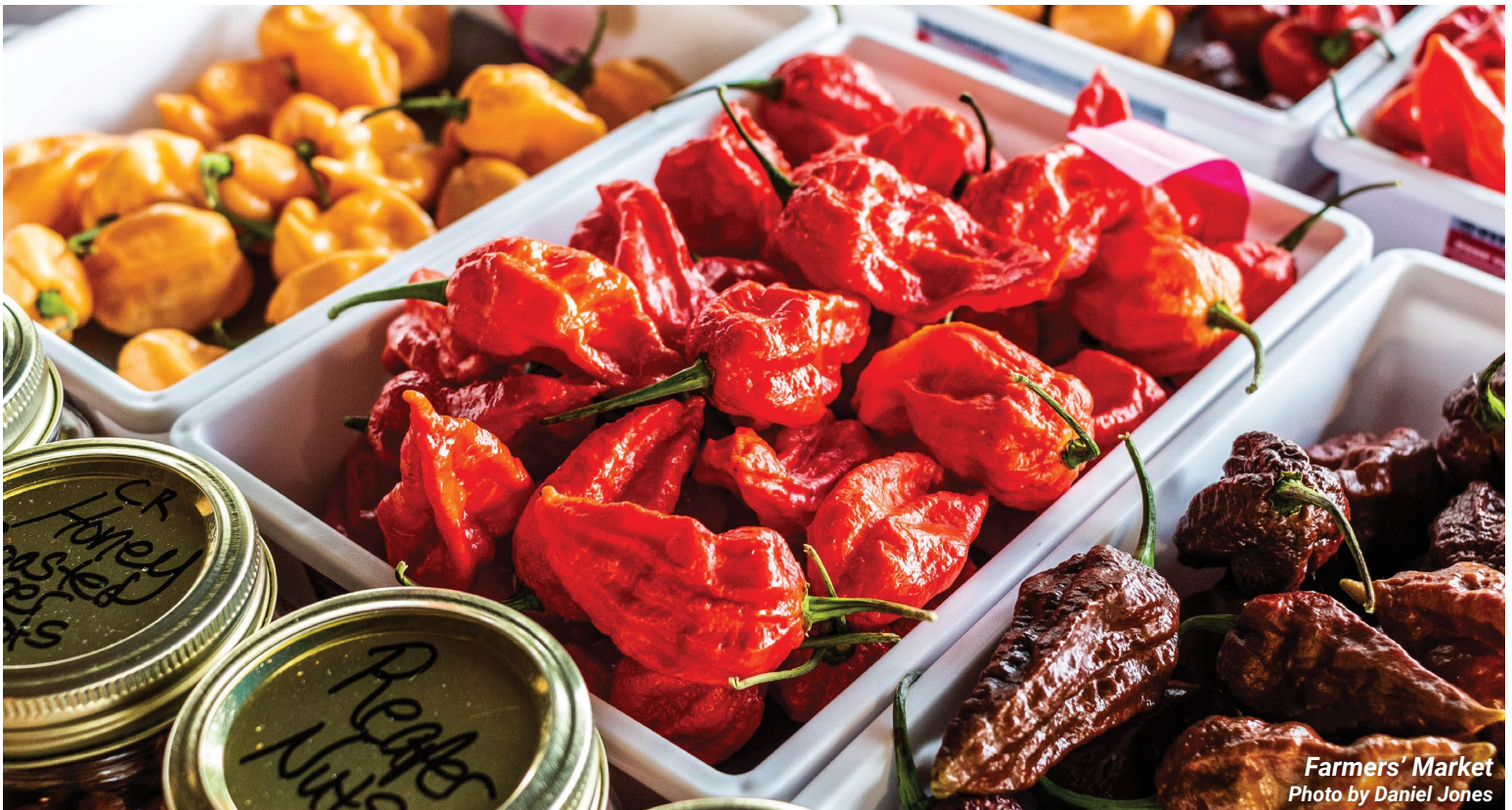
Farmers' Market