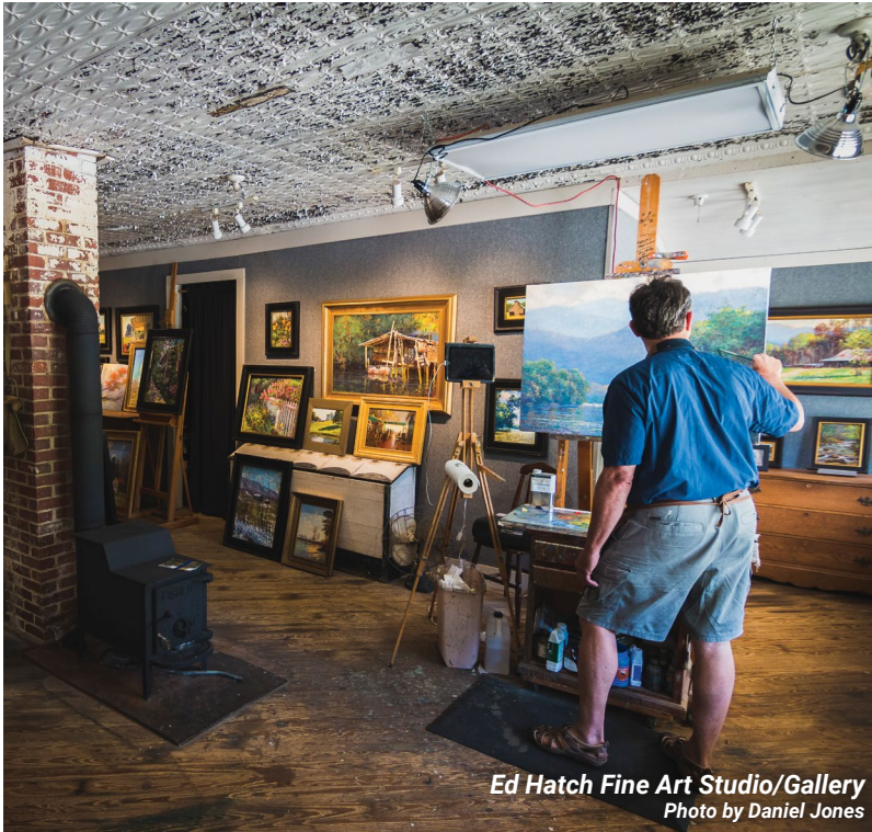
Ed Hatch Fine Art Studio/Gallery