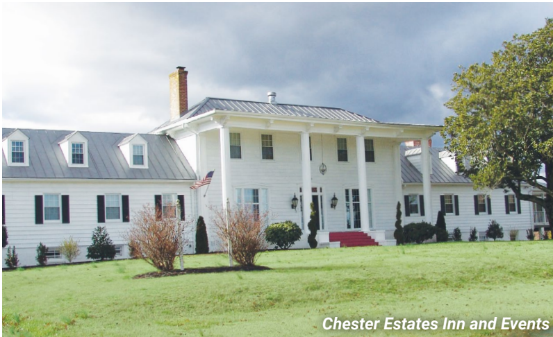
Chester Estates Inn and Events