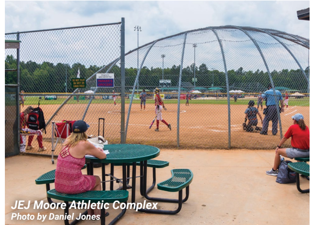
JEJ Moore Athletic Complex