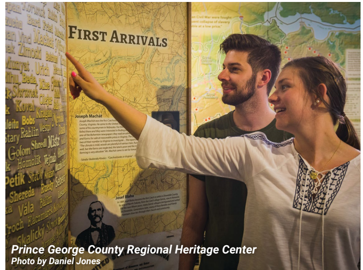
Prince George County Regional Heritage Center