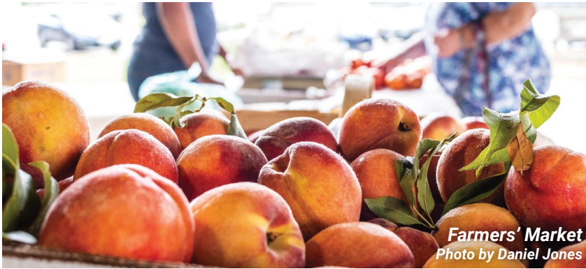
Farmers' Market