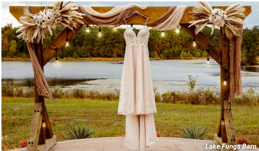
Lake Fungs Barn

9501 Lake Fungs Road Disputanta, VA 23842 202-813-0163 www.lakefungsbarn.com