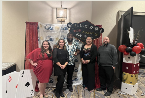
Pictured above: RCJA Staff attend VCCJA Fundraising Event, "A Night in Vegas"