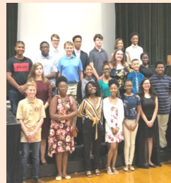
Above: 2018 Graduates

Prince George County, Prince George Schools, Appomattox Regional Library System and Joint Logistics Management, Inc. will be hosting approximately 30 students during the summer months. Students are currently preparing for this internship and will be matched with their prospective employer in early May.