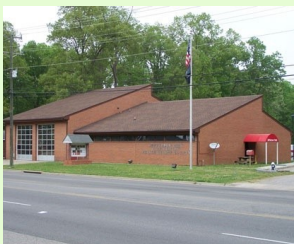
Pictured: Jefferson Park Fire Station

Fire Station Eight, located on Prince George Drive will be receiving electrical upgrades to ensure that the structure is safe and in compliance. Both projects are on schedule to start in late spring.