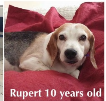
Rupert 10 years old