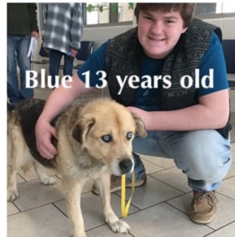
Blue 13 years old

We have had several adoptions of senior pets recently.