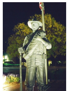
Spanish American War

A confirmation statement will be mailed to you. It will serve as your receipt and will also show the information to be inscribed on your brick(s). Call 513.745.8500 for more info.