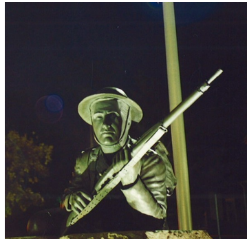
World War I