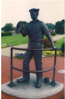
World War II