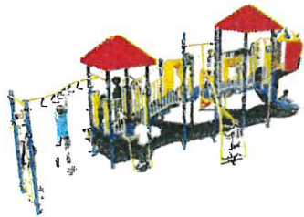
Play Structure (ages 5-12)