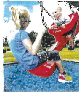
Generation Swing Seat