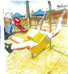
Bucket Tot Seat