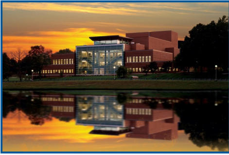
The Foundation Performing Arts Center