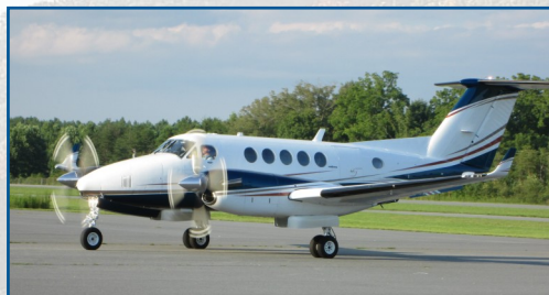
Rutherford County Airport

Interstate-quality US Highway 74 connects I-26 and I-85, serving as a corridor between three regional centers of commerce. US Highways 64 and 221 each provide access to I-40 and I-85. (See map at bottom right) Rutherford County Airport at Marchman Field is a 250-acre airport equipped with a 5,000 linear foot runway. On average, 92 aircraft operations are handled daily, including single and multi-engine aircrafts, jets, and helicopters. Charlotte-Douglas International Airport, Greenville-Spartanburg International Airport, and Asheville Regional Airport are within a 60 mile drive connecting you to the world.