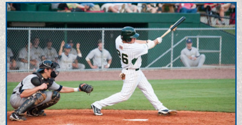
Forest City Owls Baseball

Tryon International Equestrian Center, one of the largest equestrian show and training facilities in the country, is located 4 miles from the Rutherford County border in Polk County. Rutherford County also features seven challenging golf courses, including Forest City Municipal Golf Course, Cleghorn Plantation Golf & Country Club, Bald Mountain and Apple Valley Golf Courses at Rumbling Bald Resort, and Lake Lure Municipal Golf Course, to name a few; many more golf courses can be found in our neighboring communities.