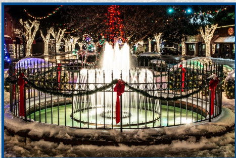
Christmas in Downtown Forest City