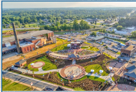
Pavilion On Park Square

Rutherford County is home to multiple historic Main Street shopping districts, each featuring one-of-a-kind boutiques and specialty shops. From the oldest General Store in the State to brand new innovations in custom consumer goods, the shopper is sure to find great treasures. With four large metro areas within one hour's drive, regional shopping ranges from modern malls to unique antique and craft stores.