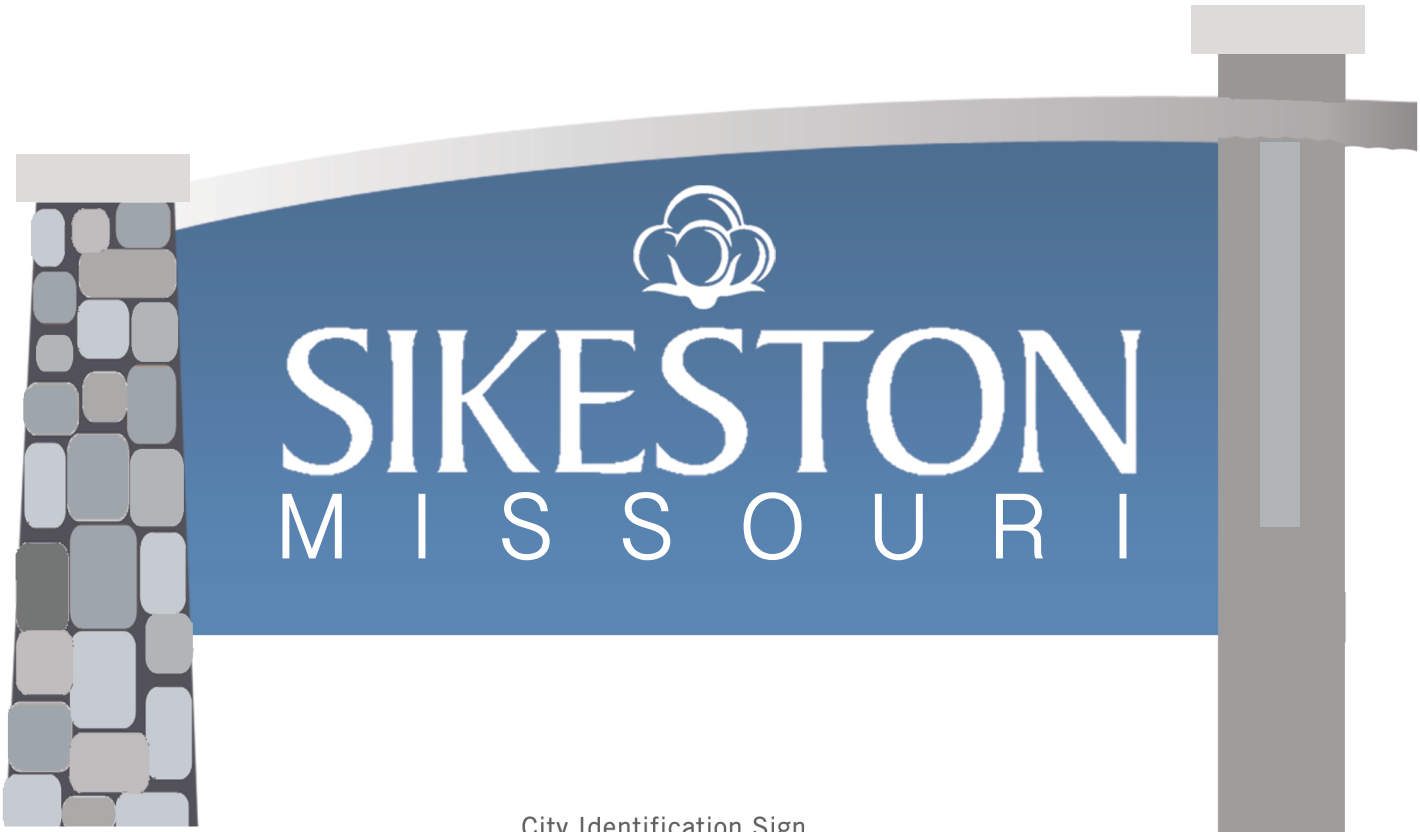
City Identification Sign