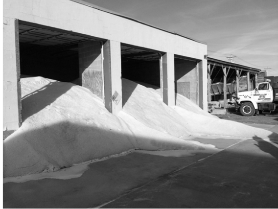
Salt Storage Building: $25,000