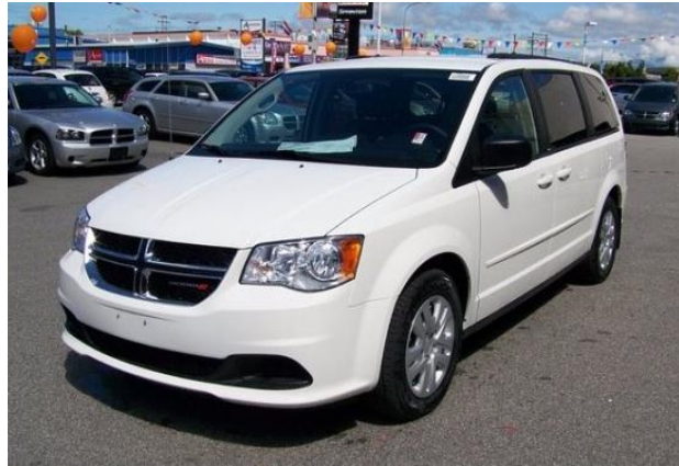
Dodge Caravan (2013)