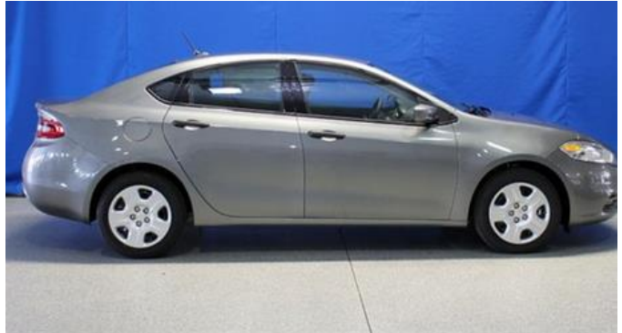
Dodge Dart SE (2013)