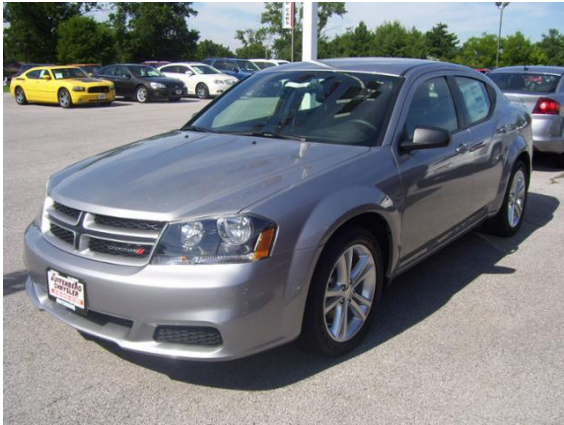
Dodge Avenger (2013)