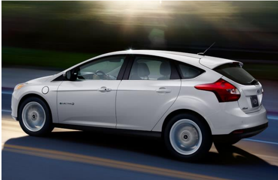
Ford Focus (2014)