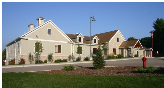
Suamico Municipal Services Center 12781 Velp Ave. Suamico, WI 54313

Welcome to the Village of Suamico. We hope you will find this guide useful in acclimating yourself to our community. Suamico is a rapidly growing area with a nice balance of urban conveniences, up and coming neighborhoods, historic charm and rural characteristics. The Village of Suamico, located in Brown County, covers approximately thirty-six square miles and has a population of just over 13,200 residents. It is situated on the west bank of the bay of Green Bay with water access via the Suamico River. Much of the village is serviced by the Howard-Suamico School District, with a small portion going to Pulaski Community Schools. We are governed at large by a Village Board consisting of six trustees and a village president. The Village contracts with the Brown County Sheriff's Department for police services, County Rescue Services for emergency rescue calls and Harter's Fox Valley Disposal for garbage and recycling services. Our fire protection services are provided by our Fire Chief and a volunteer staff of approximately 40 firefighters. Suamico also has a municipal court that handles traffic and ordinance violations. WELCOME!