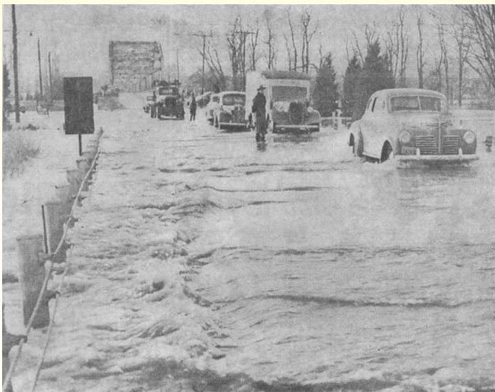
Vestal Side of Vestal-Union Bridge Minutes before it was Closed to Traffic in 1948.

Other notable floods occurred on March 8, 1902, October 17, 1903, July 8, 1935 and the "greatest flood in history" on March 18, 1936. Newspaper reports of 1936 said both the Chenango and Susquehanna were at their highest levels in history. The Binghamton waterworks was flooded and the Endicott waterworks closed leaving residents with only a one day water supply. Everyone, including those using well water, was advised to boil their drinking water. Health officials quickly established clinics to immunize over 3000 school children against typhoid. The flood of March 22, 1948 once again carried river water polluted with factory and human waste into Vestal's homes.