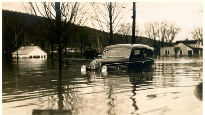
Roberts Street Under Water in the 1936 Flood.

Actual hurricanes are extremely rare in this area. Hurricane Hazel that struck on Friday, October 15, 1954 was the first recorded hurricane in the Southern Tier. Hazel traveled north from Virginia on a track just slightly west of Binghamton, over Lake Ontario, and into Canada. The storm in our area lasted for three hours during which winds reached a record-breaking average of 72 mph with gusts of 94 mph. The heavy rains predicted to accompany the storm did not materialize sparing the area of additional damage. Traffic on the western end of Vestal Road was blocked for most of the night when the cupola of Eldredge's barn landed on the road. And then there was Agnes in 1972. The devastation suffered by the Southern Tier on September 8, 2011 was caused by Tropical Storm Lee which leads us to the final and most prolific type of weather in this area....floods.