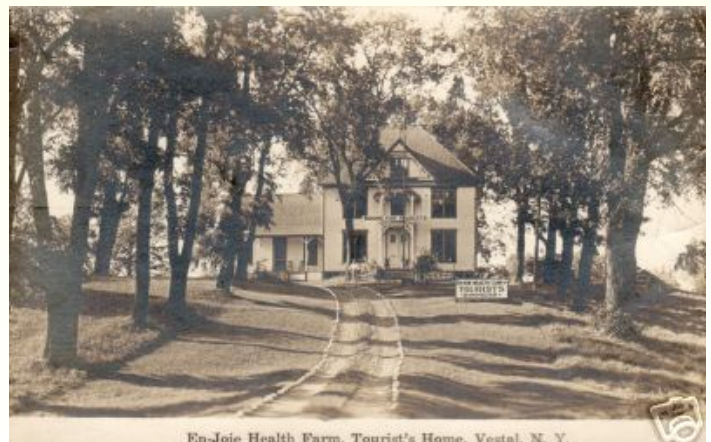
Photo captured from eBay Seller Ad