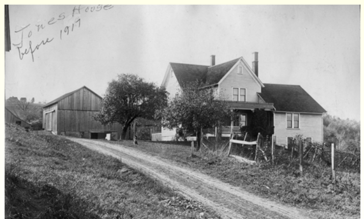
Jones Road before 1917 Passes in Front of the Jones Farmhouse.

Locally, a 1926 ad for lots in the Rood Subdivision in Twin Orchards boasted they were easily accessible from Endicott and Binghamton on the new Binghamton – Vestal Concrete Highway, formerly River Road and sometimes referred to as Vestal Avenue. A 1939 County Highway map labels Vestal Road as No. 1613 from the city line to Main Street. West of Main Street the road was numbered 420 and 5215. The NYS DOT maintains a list of touring numbers which were assigned to some roads in addition to their designated number and name. For example, Choconut Creek Road was numbered 8331 and assigned touring number Route 26.