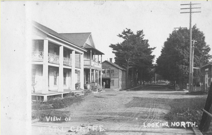
Choconut Creek Road in Vestal Center.

The new concrete Vestal – Vestal Center Highway opened in 1930 connecting the center of Vestal to the Pennsylvania border. Pennsylvania continued the concrete road to Choconut, furnishing a new route to Montrose. In 1948 the Vestal – Vestal Center Highway was widened from 20 to 24 feet and resurfaced with asphalt.