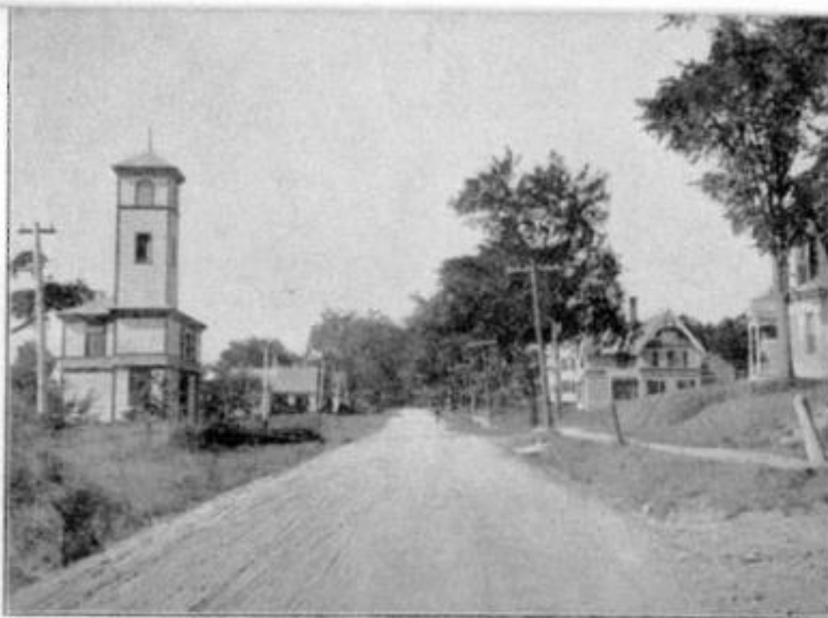
Winterport, Me., Kelly Hose House.